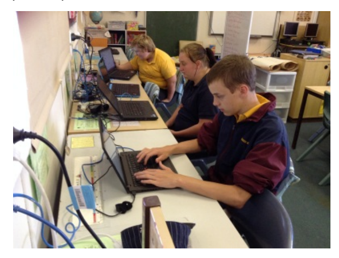
Students working on the new laptops