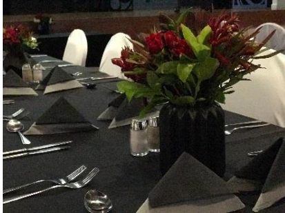
The beautiful table decorations at the Quirindi RSL Club

The nervous wait for some students has become less nervous as they have been receiving early entry offers to university. Congratulations to these students.