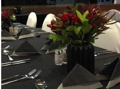
The beautiful table decorations at the Quirindi RSL Club

The nervous wait for some students has become less nervous as they have been receiving early entry offers to university. Congratulations to these students.