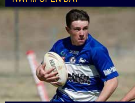
RONIN - BEARS BOUND