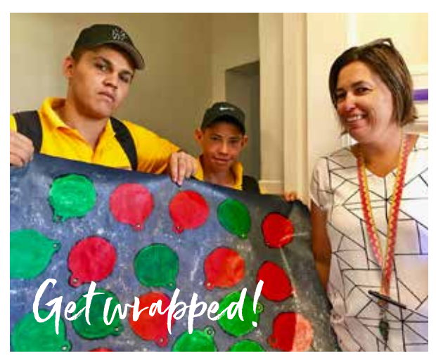
Its Christmas season and the Support Unit were photographed selling festive wrapping paper at the school. Well done!