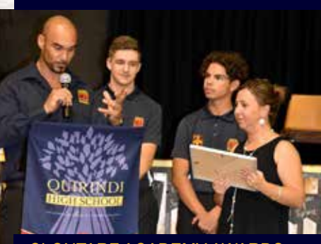
CLONTARF ACADEMY AWARDS