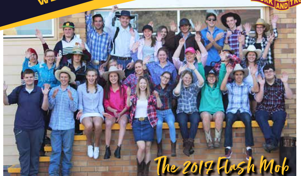
2017 Year 12 students performed a flash mob dance routine at their final Monday Assembly this week.