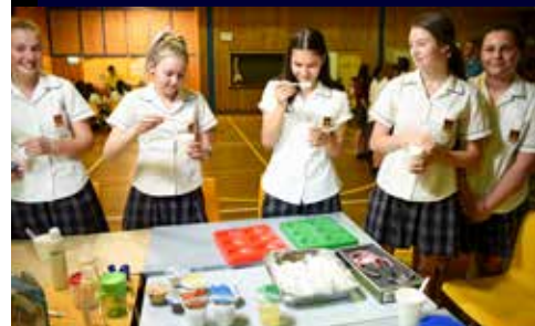
UNI VISIT - MEDICAL CAREERS