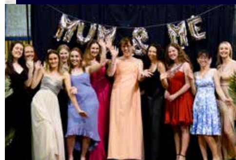
MUM AND ME HIGH TEA