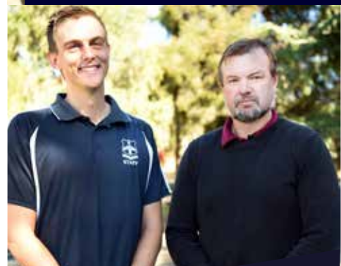
WORLD CLASS LEADERS