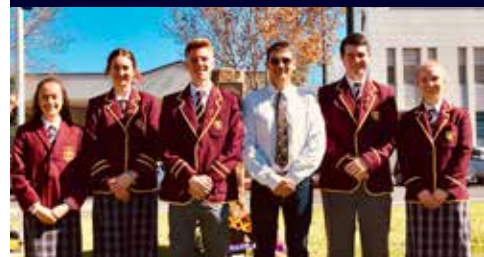
VIETNAM REMEMBRANCE DAY