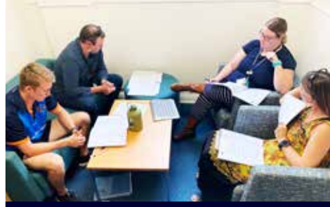
QUALITY TEACHING PROGRESS