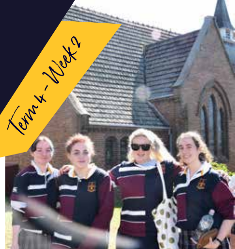
HSC EXAMS COMMENCE