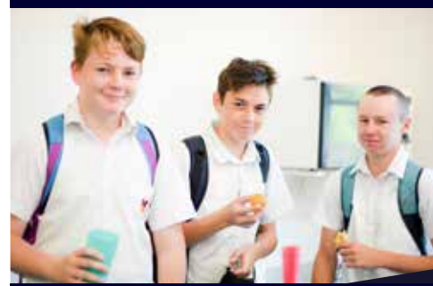
BREAKFAST CLUB RETURNS