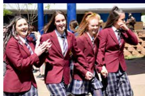
YEAR 12 GRADUATION