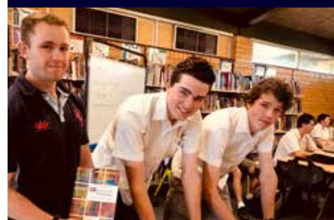
INCOMING YEAR 12