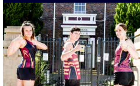
NEW TEAM SPORTS SHIRTS