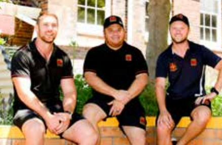
CLONTARF MEET & GREET